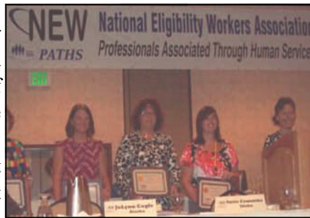
Top Photo: National NEW President